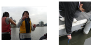
Field Photos (requires release forms)